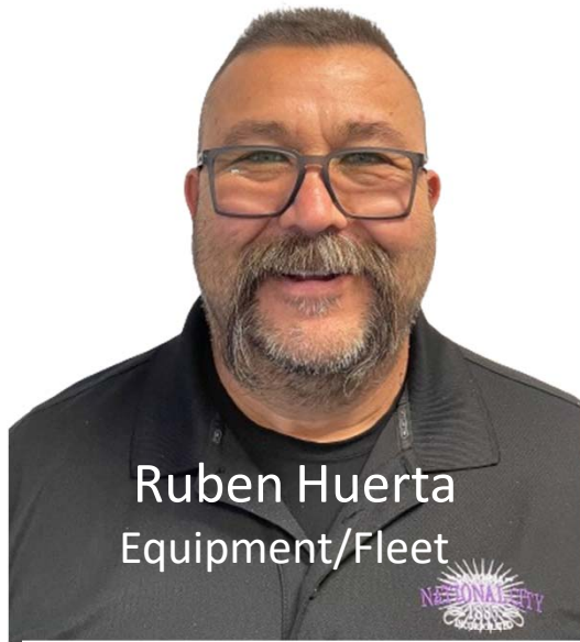
Ruben Huerta Equipment/Fleet