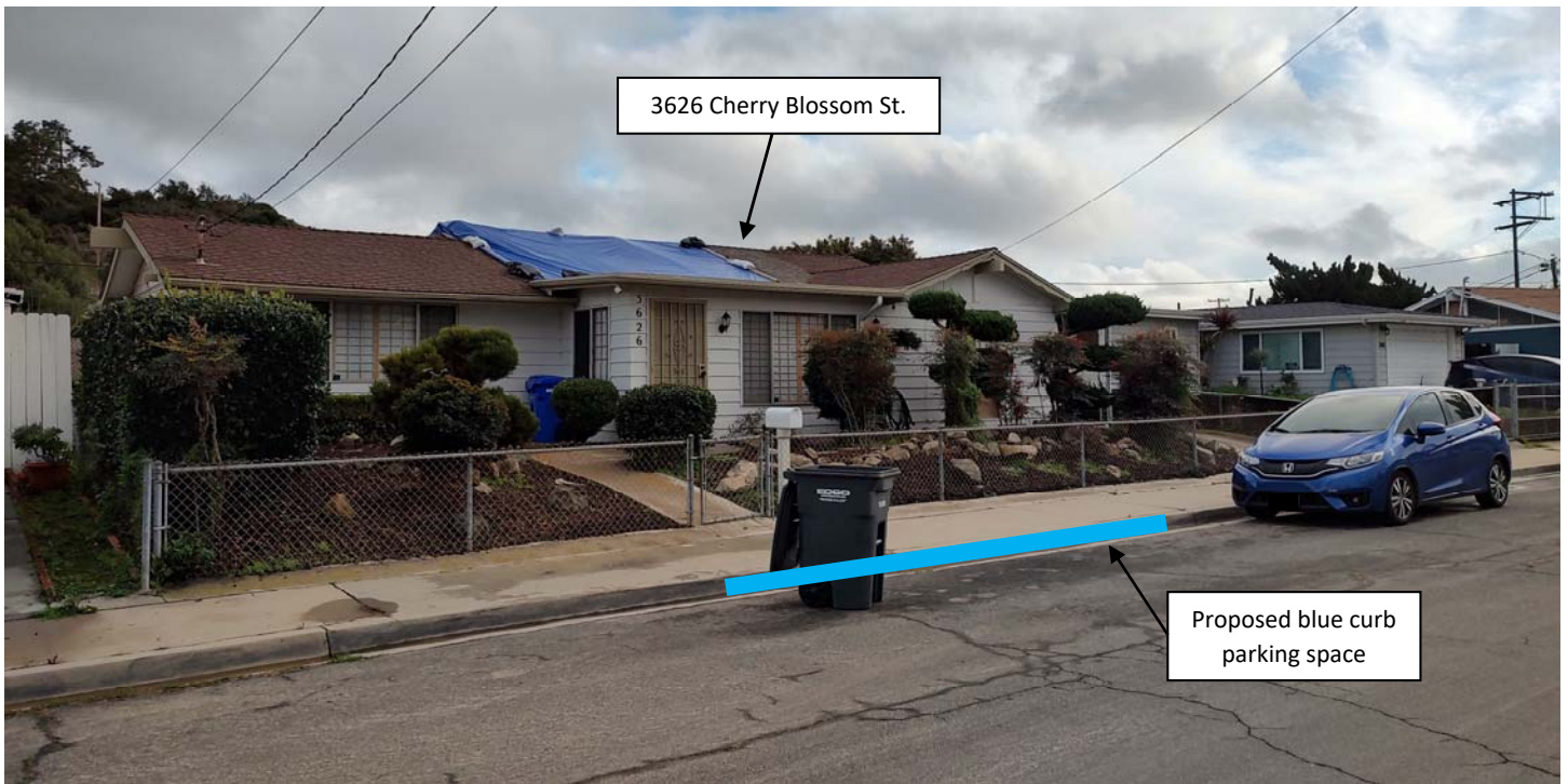
Location of proposed blue curb disabled persons parking space in front of 3626 Cherry Blossom Street (Looking South)