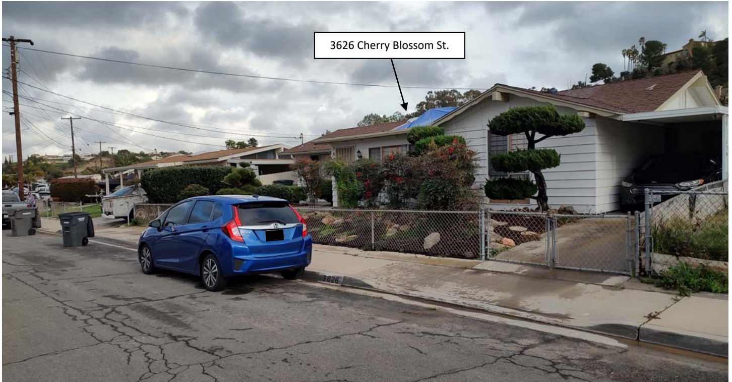
Photo of the driveway at 3626 Cherry Blossom Street (Looking East)