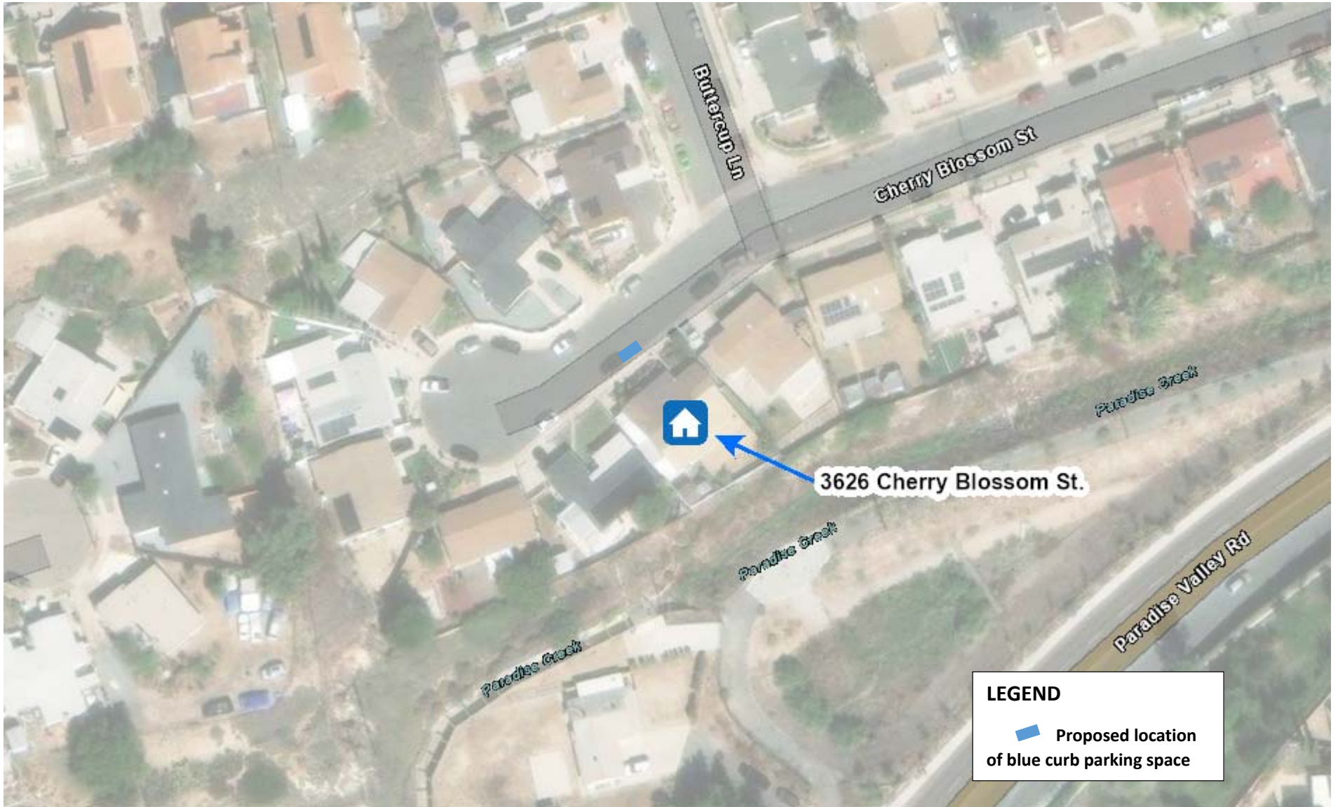
Exhibit B: Location Map Showing Existing Blue Curb Parking Space (TSC Item: 2024-01)