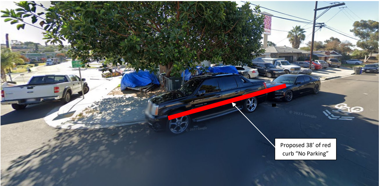
Location of proposed red curb "No Parking" on E 12th Street (Looking South)