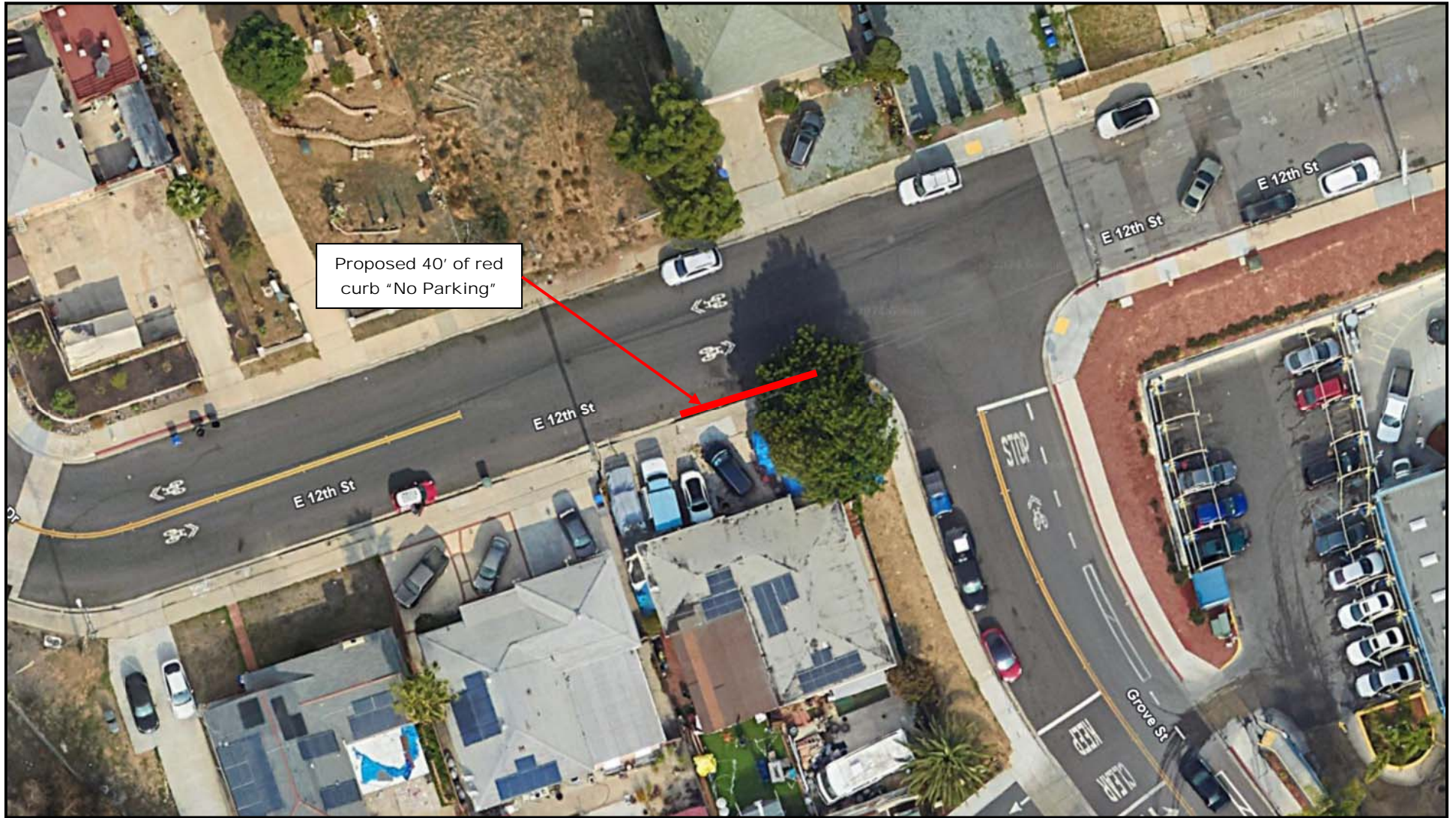
Exhibit A: Location Map with Recommended Enhancements (TSC Item: 2024-02)