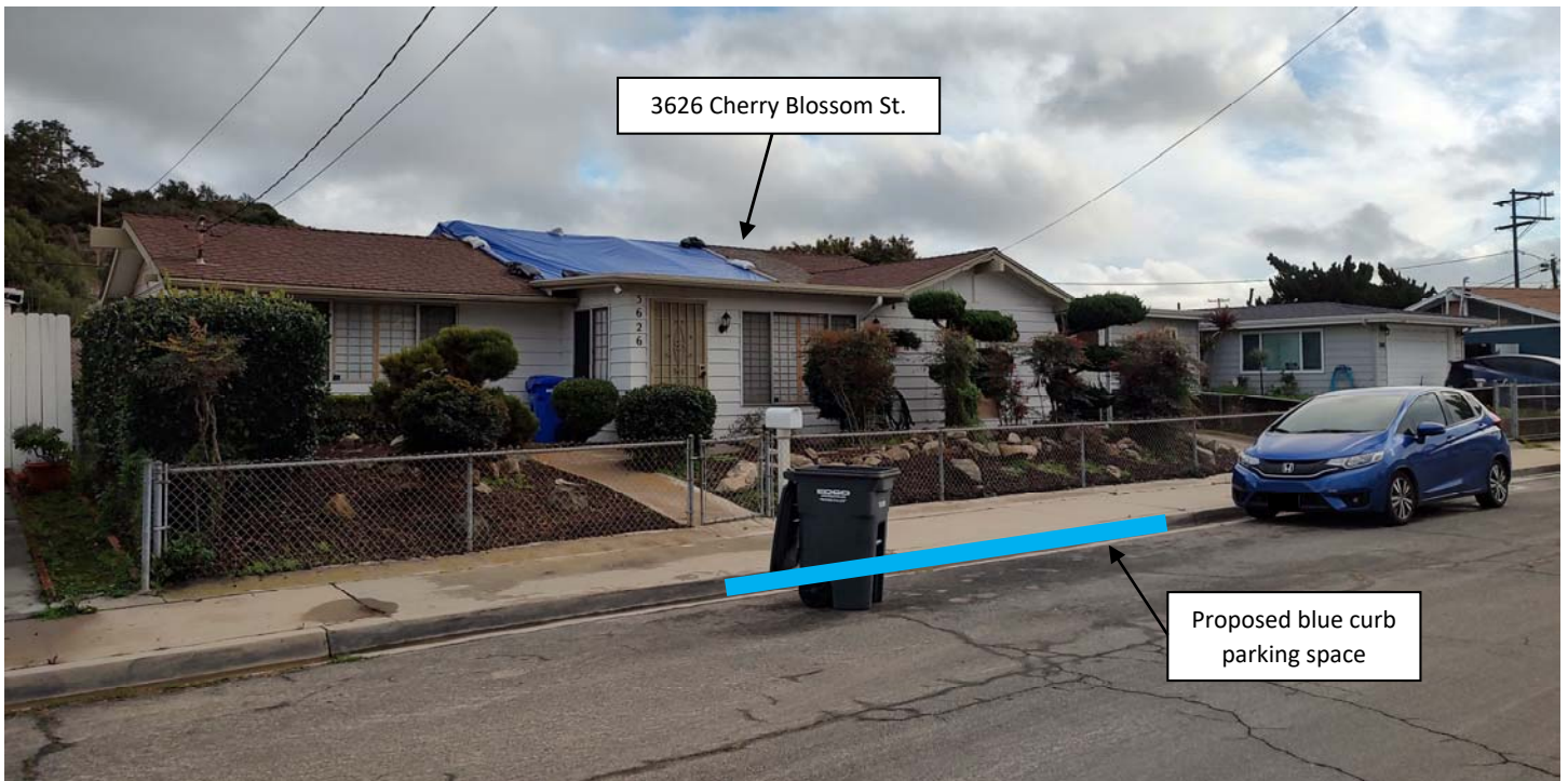
Location of proposed blue curb disabled persons parking space in front of 3626 Cherry Blossom Street (Looking South)