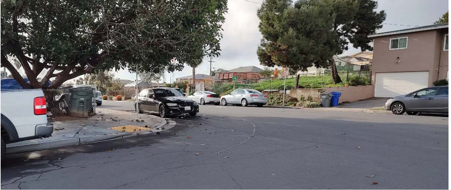
Location of proposed red curb "No Parking" on E 12th Street (Looking West)